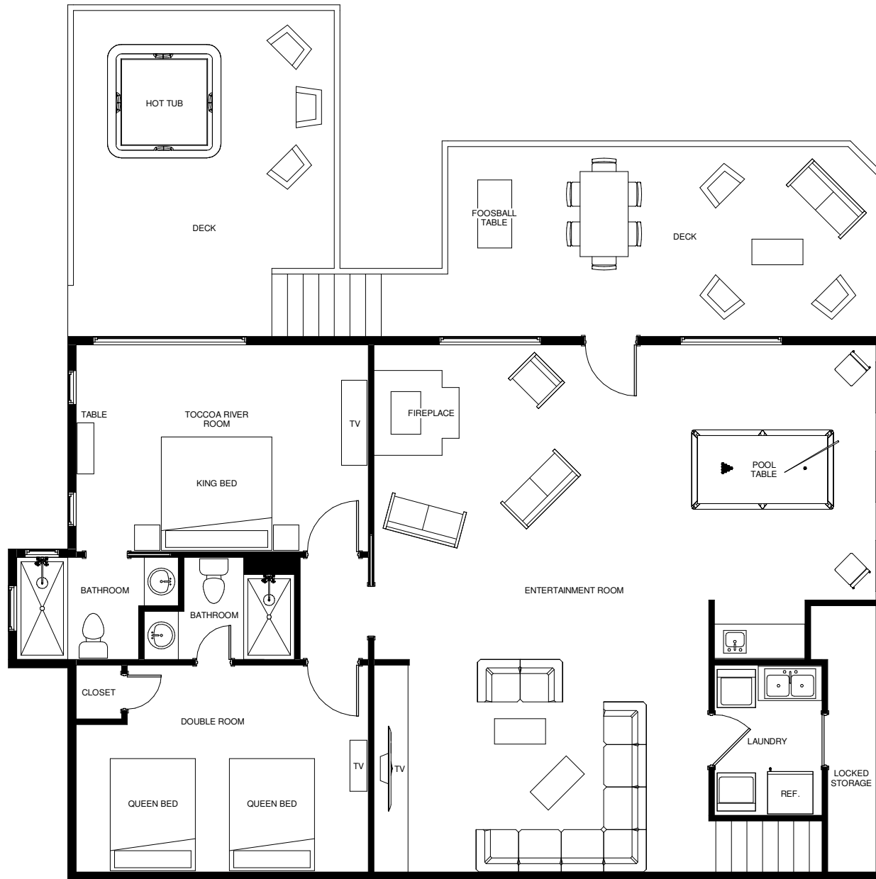
A BASEMENT FLOOR PLAN Scale: 1/8" = 1'-0"