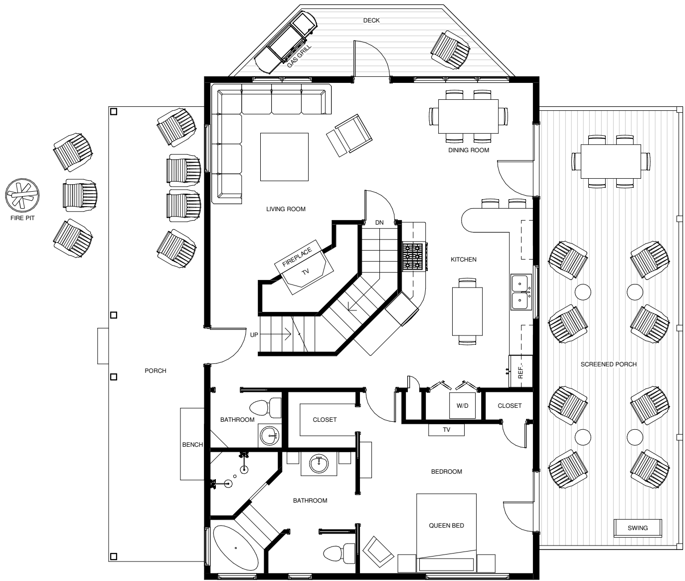
A FIRST FLOOR PLAN Scale: 1/8" = 1'-0"